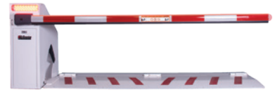
Parking Wedge Operator

HySecurity strives for simplicity. Easy to install. Easy to configure. Easy to maintain. Easy to troubleshoot and repair. Your WedgeSmart DC barrier arm is built to last.